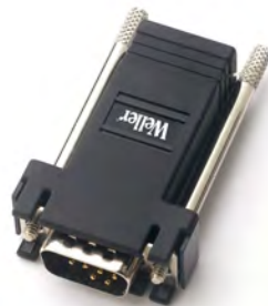
WX Adapter for WFE / WHP