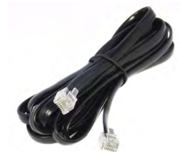
WX connection cable