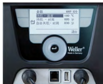
Multiple language menu navigation