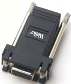
WX Adapter for PC