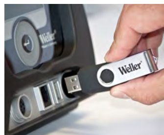
Multi-purpose USB port