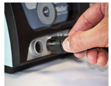
WX tool connection