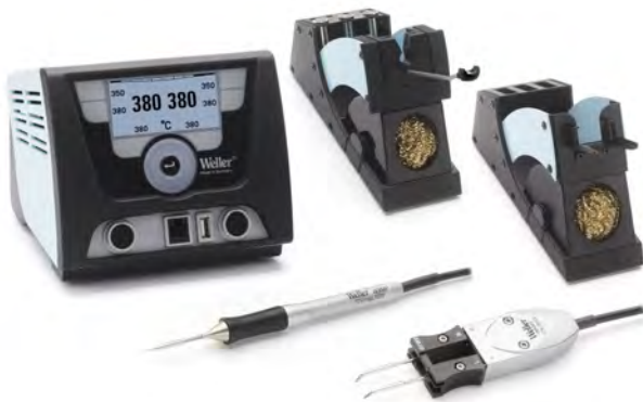
WX 2 soldering station WXMP Micro soldering iron & WXMT Micro tweezer