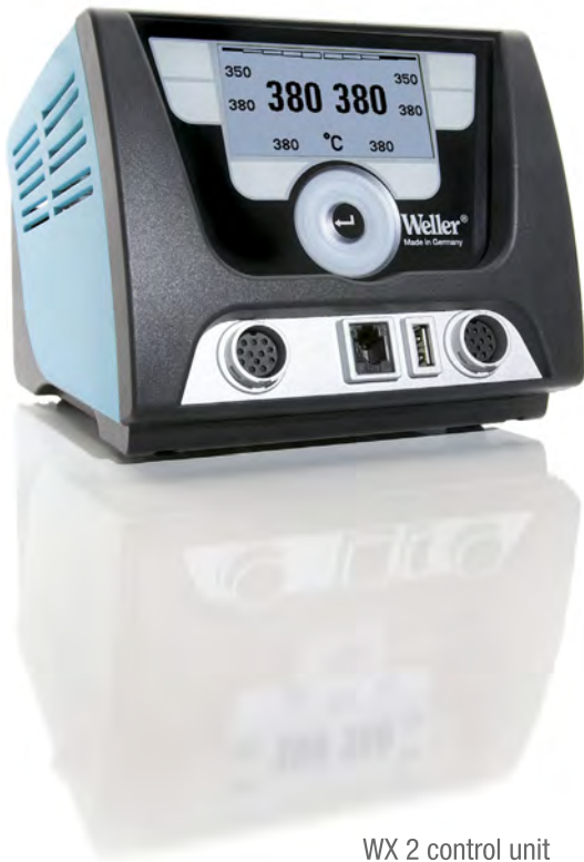
WX 2 control unit