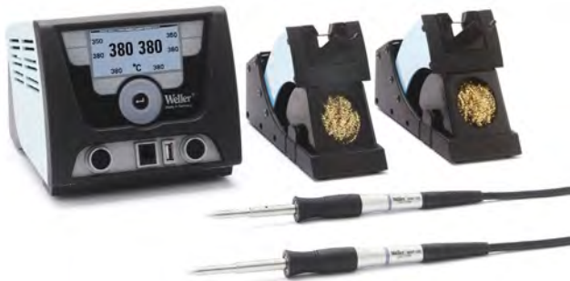
WX 2 soldering station with 2 WXP 120 soldering irons